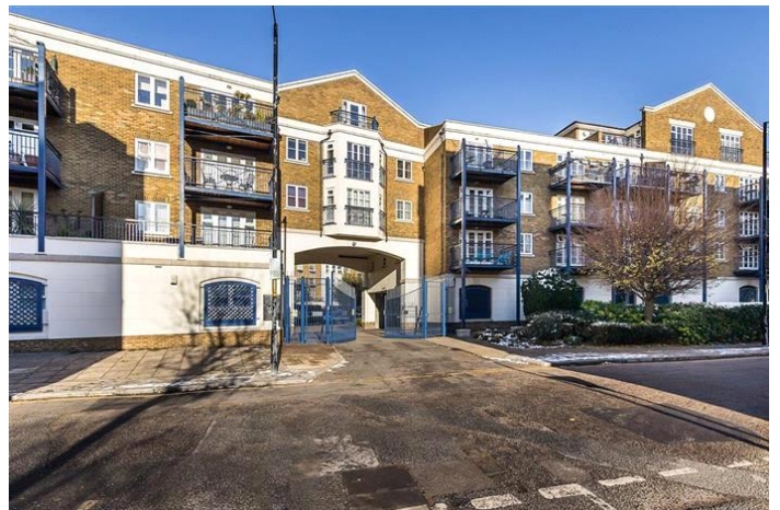
ORIANA HOUSE, VICTORY PLACE, LIMEHOUSE, E14 £1,850 PCM