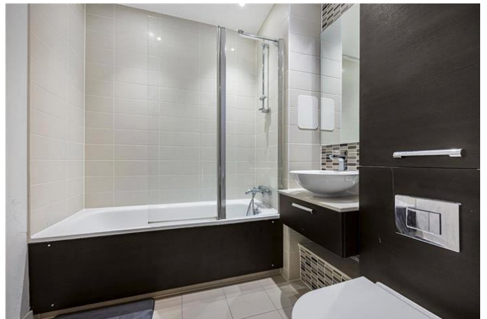
CLUBHOUSE APARTMENTS, POPLAR, E14 £2,250 PCM