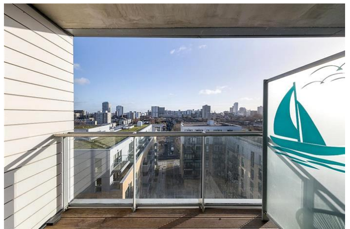
MORO APARTMENTS, POPLAR, E14 £1,850 PCM