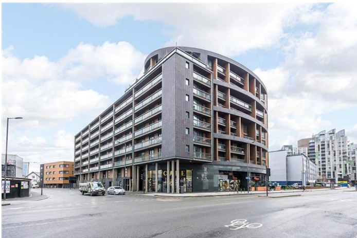
THE SPHERE, CANNING TOWN, E16 £1,650 PCM