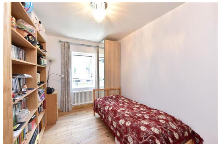
WHITEADDER WAY, ISLE OF DOGS, E14 £2,600 PCM