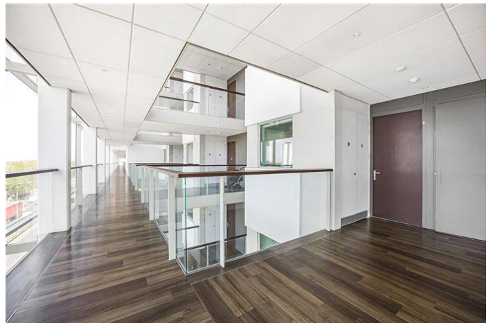
PIONEER COURT, CANNING TOWN, E16 £1,950 PCM