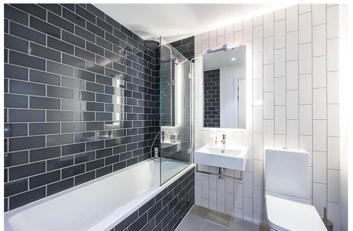
LAKER HOUSE, ROYAL WHARF, E16 £2,500 PCM