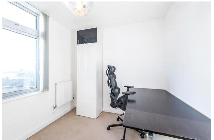
IONA TOWER, LIMEHOUSE, E14 £2,300 PCM