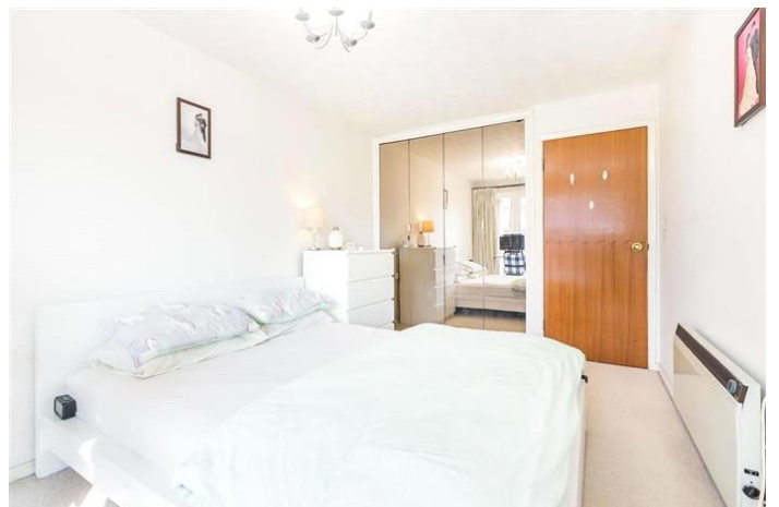
PLYMOUTH WHARF, ISLE OF DOGS, E14 £2,150 PCM