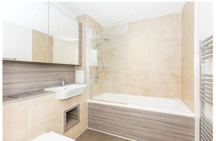
PIONEER COURT, CANNING TOWN, E16 £1,750 PCM