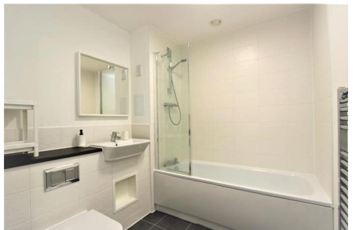
SONAR HOUSE, HAINAULT, IG6 £1,500 PCM