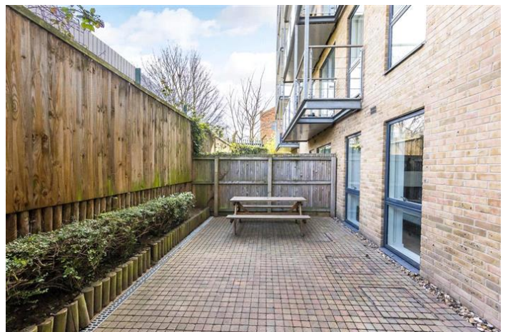
KARA COURT, BOW, E3 £1,650 PCM