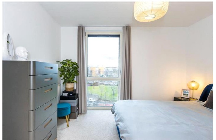
HARSTON WALK, BOW, E3 £1,850 PCM