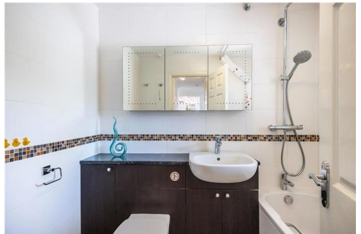
PLYMOUTH WHARF, ISLE OF DOGS, E14 £2,150 PCM