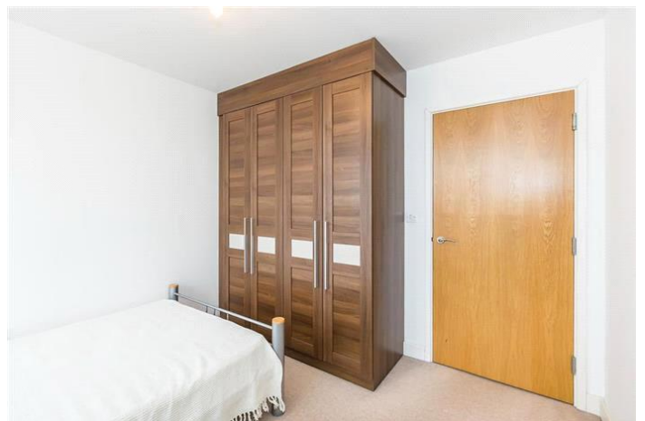
ROSS APARTMENTS, ROYAL DOCKS, E16 £2,200 PCM