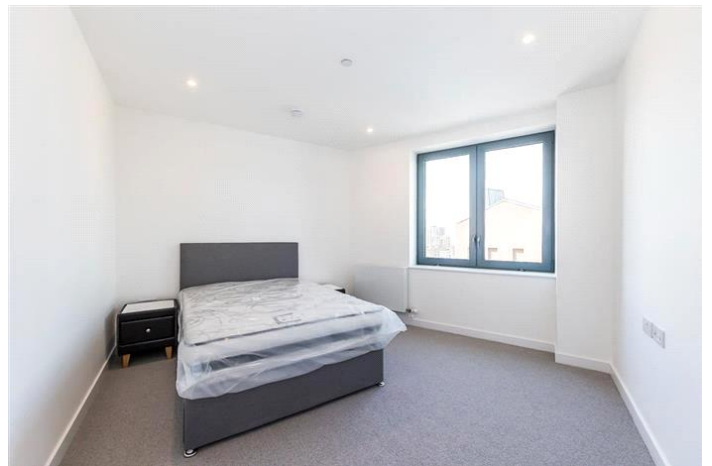
SKYLINE APARTMENTS, BOW, E3 £2,250 PCM