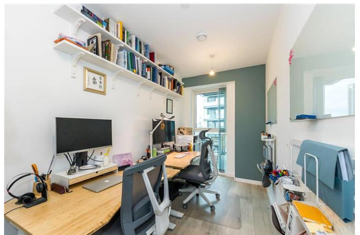
EFFRA GARDENS, CANNING TOWN, E16 £2,250 PCM