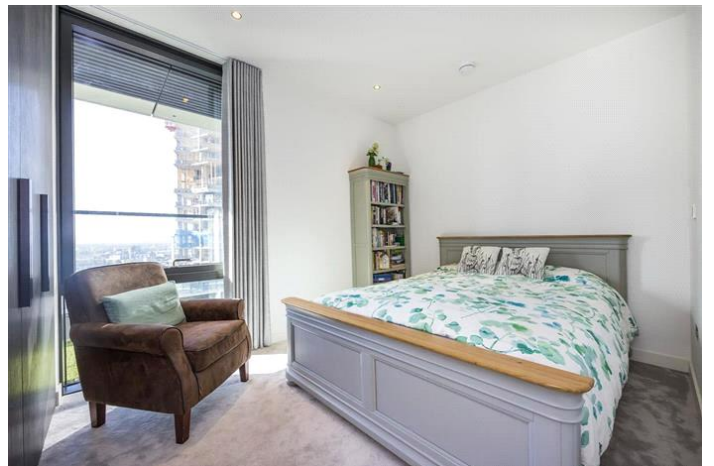
BAGSHAW BUILDING, CANARY WHARF, E14 £1,150,000 Leasehold