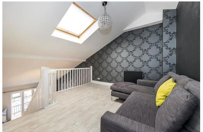
HAMILTON HOUSE, LIMEHOUSE, E14 GUIDE PRICE £775,000 Leasehold