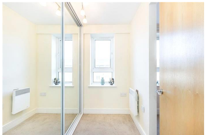
ST. DAVIDS SQUARE, ISLE OF DOGS, E14 £335,000 Leasehold