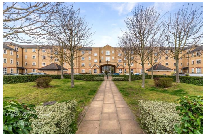
WHEAT SHEAF CLOSE, ISLE OF DOGS, E14 £1,925 PCM