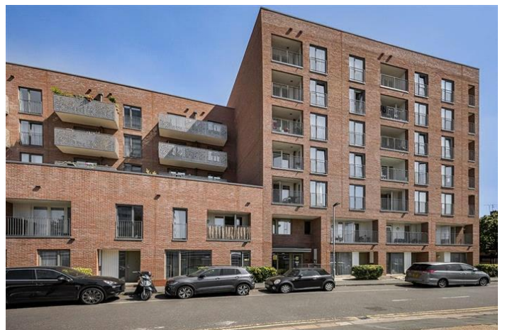
KATIE COURT, CANNING TOWN, E16 £1,630 PCM