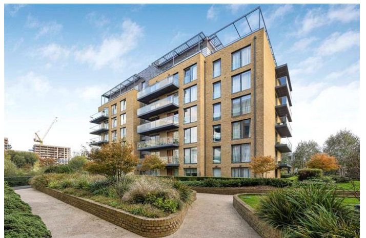
WALLACE COURT, BLACKHEATH, SE3 £1,750 PCM