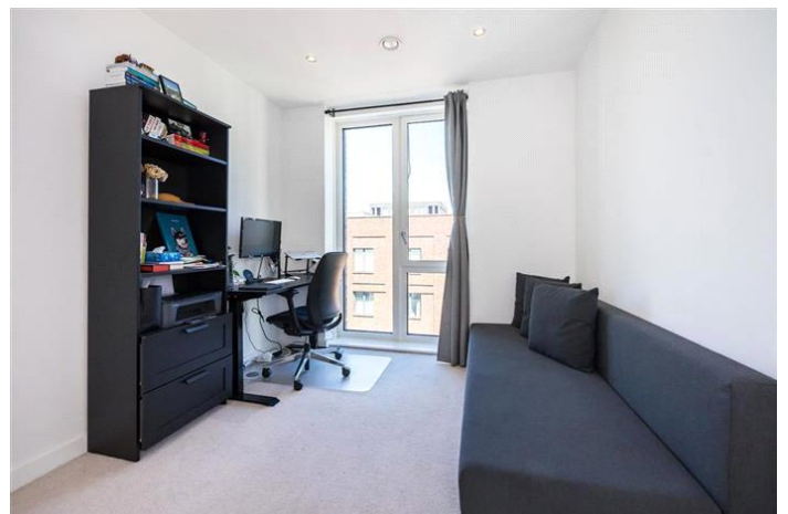
HAMME BUILDING, GALLEONS REACH, E16 OFFERS OVER £450,000 Leasehold