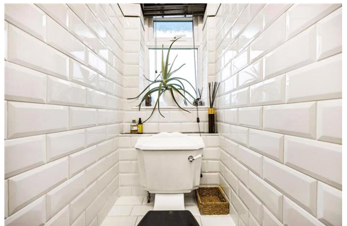
KELVEDON HOUSE, BUCKHURST HILL, IG9 £390,000 Leasehold