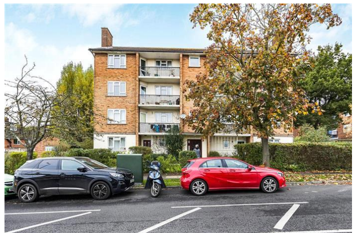
KELVEDON HOUSE, BUCKHURST HILL, IG9 £375,000 Leasehold