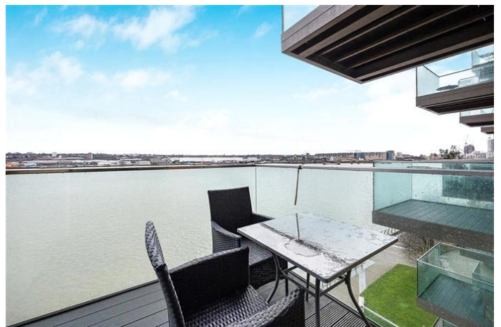
LAKER HOUSE, ROYAL WHARF, E16 £600,000 Leasehold