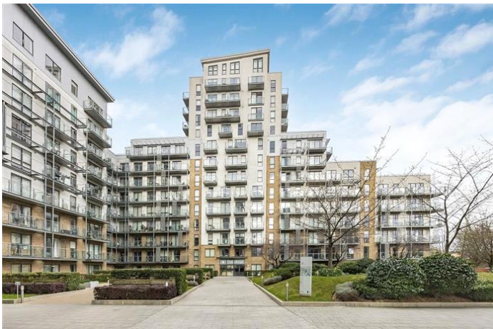
CERAM COURT, BOW, E3 £1,750 PCM