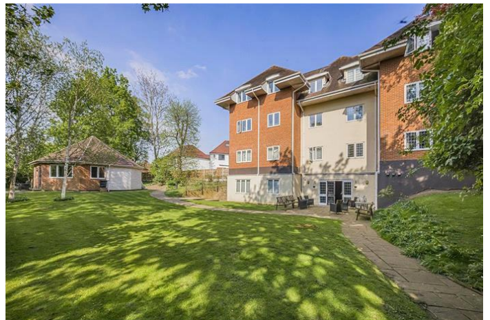
BROOK LODGE, ONGAR, CM5 £150,000 Leasehold