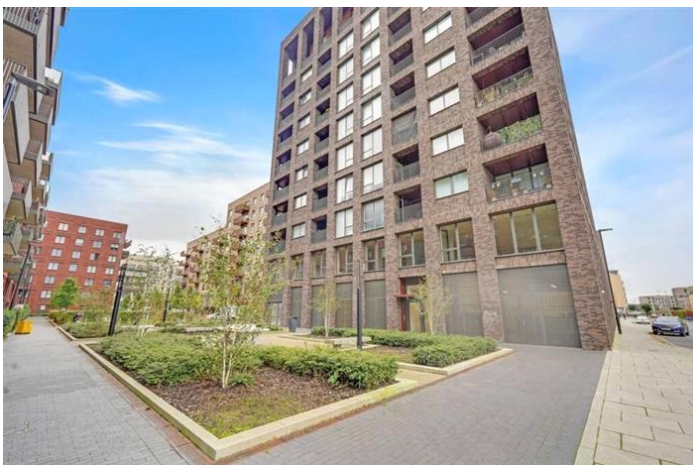
GUTHRUM COURT, GALLEONS REACH, E16 £350,000 Leasehold