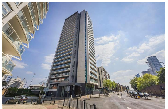
HORIZONS TOWER, CANARY WHARF, E14 £2,250 PCM