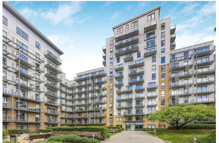
CERAM COURT, BOW, E3 £295,000 Leasehold