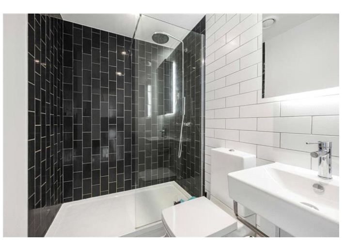
MARCO POLO TOWER, ROYAL WHARF, E16 £600,000 Leasehold