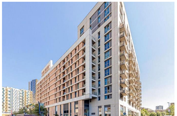
VENICE CORTE, LEWISHAM, SE13 £275,000 Leasehold