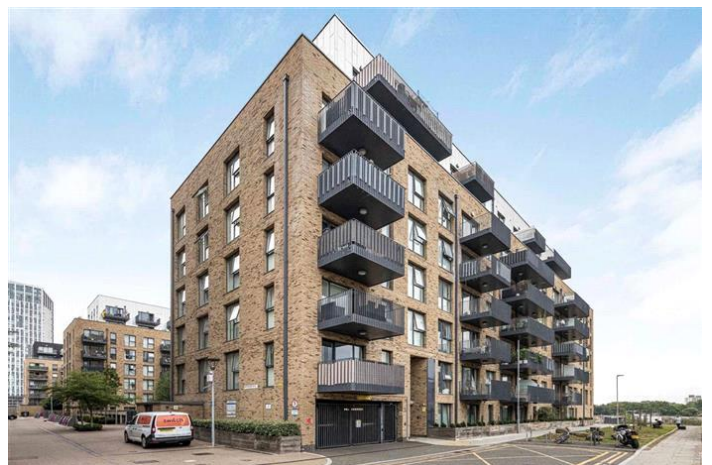
FAIRWAY COURT, BOW, E3 £2,000 PCM