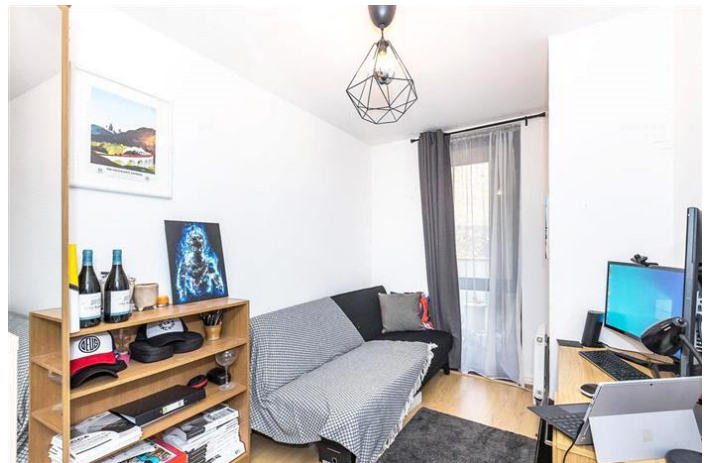
SHEPHERD COURT, POPLAR, E14 £2,000 PCM