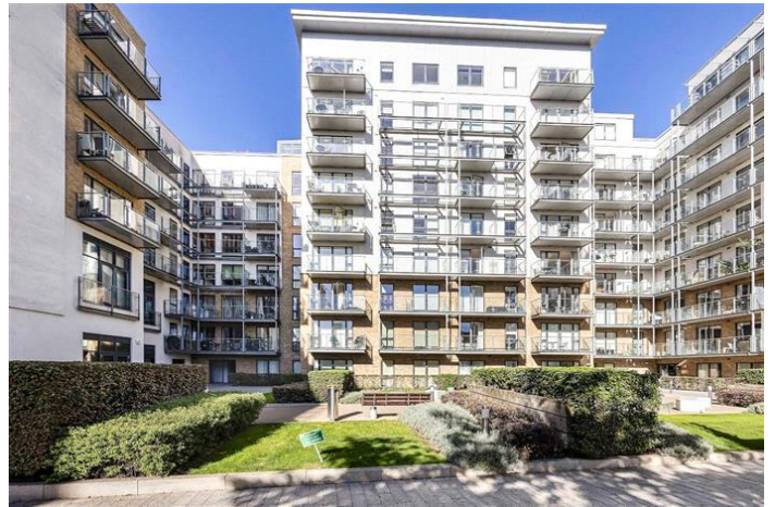
SARGASSO COURT, BOW, E3 £1,750 PCM