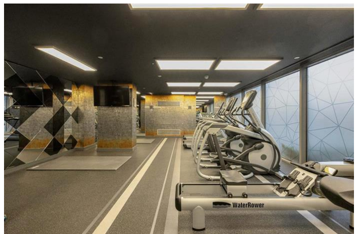
HERITAGE TOWER, CANARY WHARF, E14 £400,000 Leasehold