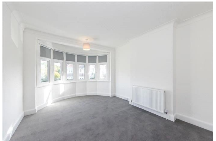
THE GLADE, CLAYHALL, IG5 £750,000 Freehold