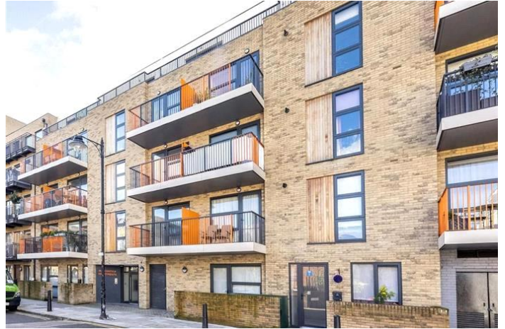
MATCHSTICK APARTMENTS, BOW, E3 £1,750 PCM