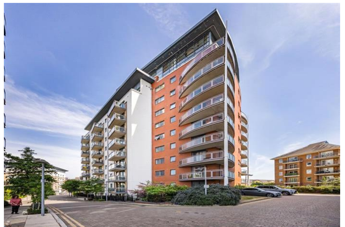
GALAXY BUILDING, ISLE OF DOGS, E14 £2,450 PCM