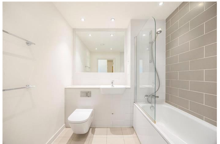
PANORAMIC TOWER, POPLAR, E14 £475,000 Leasehold