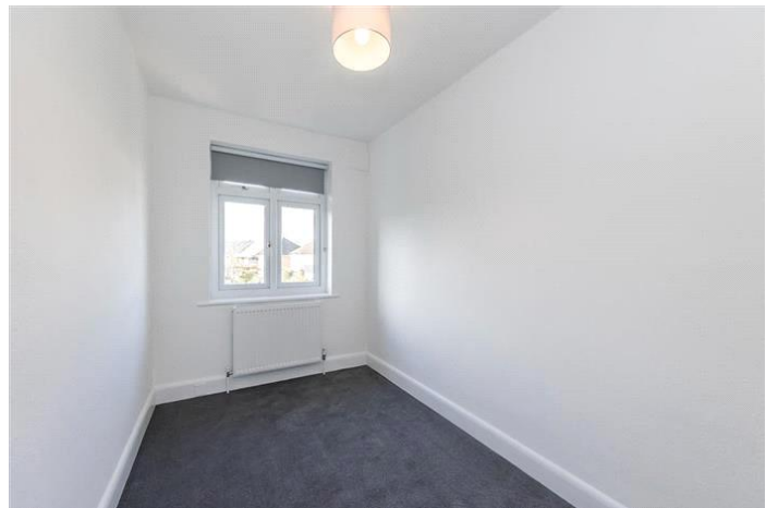
THE GLADE, CLAYHALL, IG5 £2,300 PCM